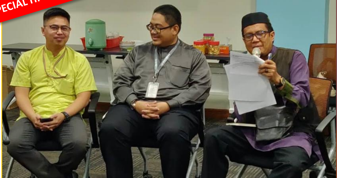
Tea With TLC with