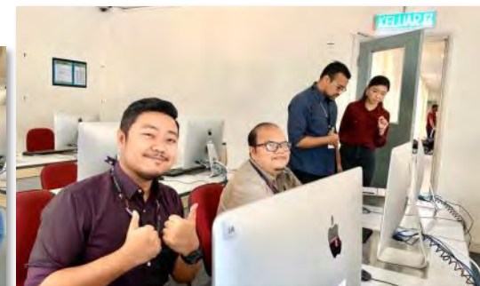
3-Day Training on Adobe Premiere (25—27 November 2019)

By MU Dot My: Multimedia and Open Source Academy