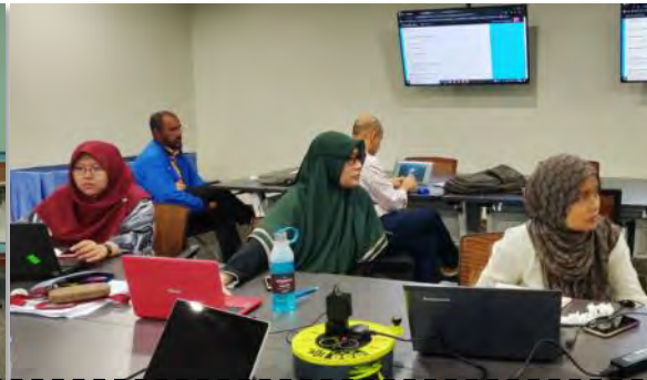
Workshop on Moodle 101: Assessment