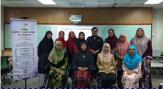
Moodle and Panopto Training