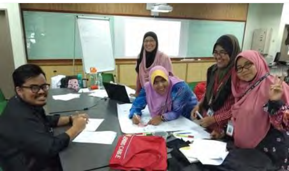
2 Days For 1 Semester Boot Camp