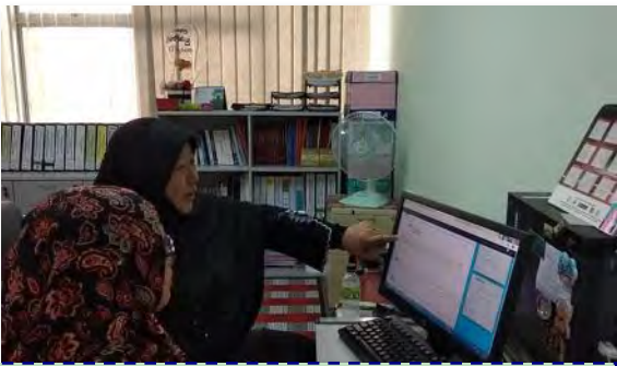
Moodle On Demand